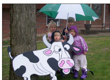
Did you have your MAD COW VACCINE?

wish, you have an opportunity to get involved in a more personal way. Through child sponsorship you can help save the life of one special child in need.